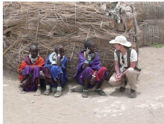
Mama Kuku hanging with the locals